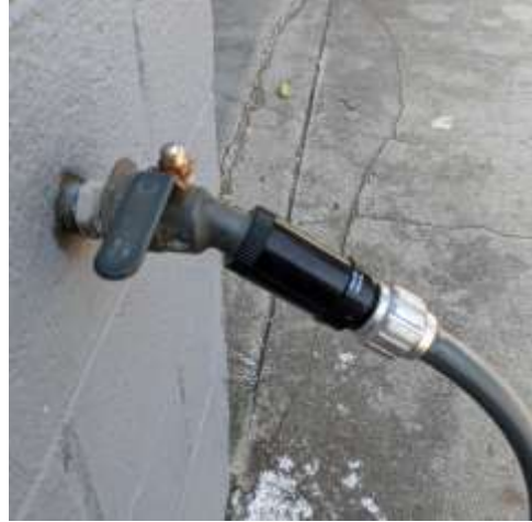
Connect Pressure regulator directly to the faucet