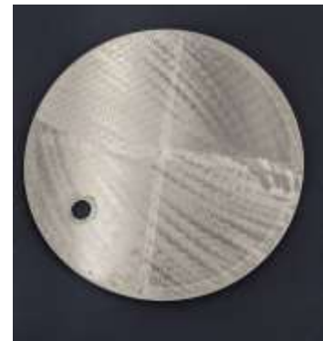
Optional heater w /clamp and gasket