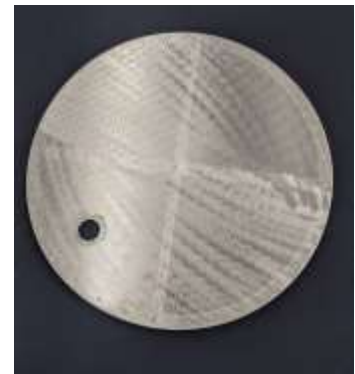
Optional heater w /clamp and gasket