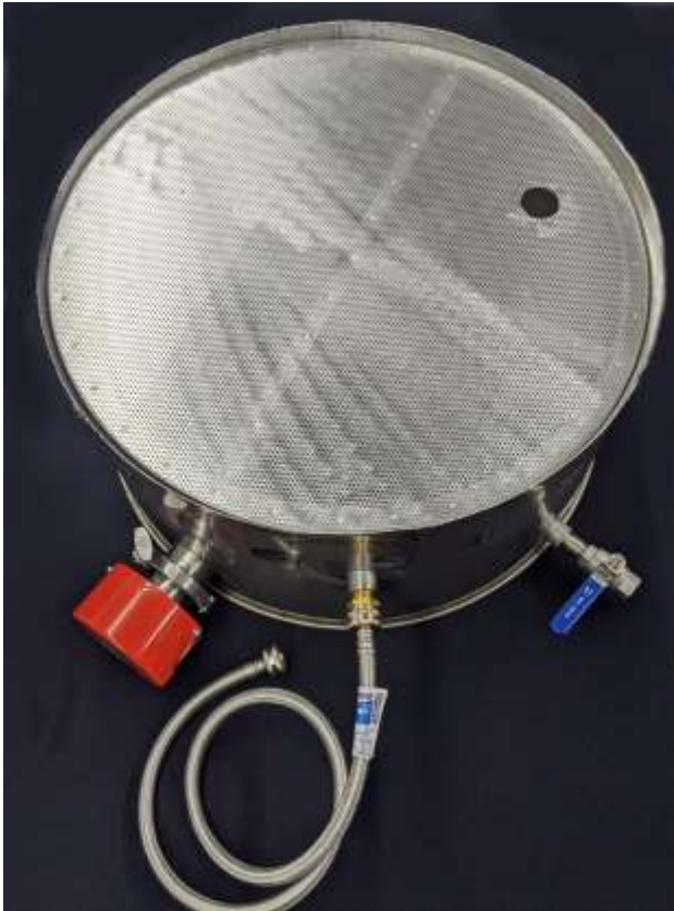
Cut down Assembled Sterilizer